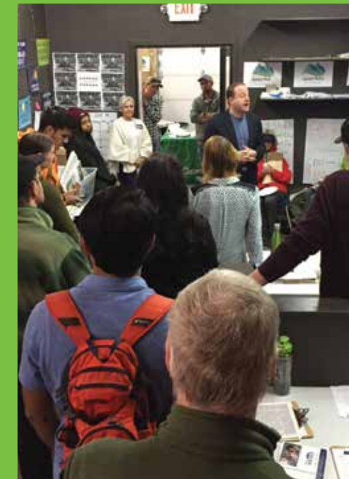
POLIS ADDRESSING VOLUNTEER CANVASSERS

To help elect Jared Polis, Conservation Colorado and its affiliated Political Action Committees (PACs) spent more than $2.6 million and knocked more than 500,000 doors. And we did it because we believe Polis is the leader we need to move Colorado forward. His decisive victory reaffirms that Colorado voters want leaders who will protect our air, land, water, and people.