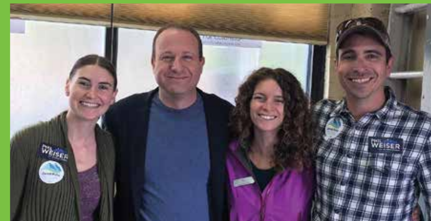
OUR STAFF WITH JARED POLIS IN GRAND JUNCTION

Polis ran — and won — on a pro-conservation vision for Colorado's future: addressing climate change, growing our clean energy economy, and protecting our public lands.