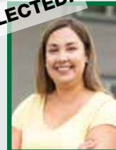
Dr. Yadira Caraveo HOUSE DISTRICT 31

Conservation Colorado proved to be a great partner from their initial endorsement through providing important field support in my race. I am excited to work with them as we pass legislation to protect our air, communities, and the health of our children.