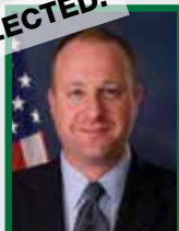
Jared Polis GOVERNOR

I look forward to working with Conservation Colorado's 40,000 members to defend our public lands, grow our outdoor recreation economy, create good-paying renewable energy jobs that can never be outsourced, and make sure we can continue to enjoy our Colorado way of life.